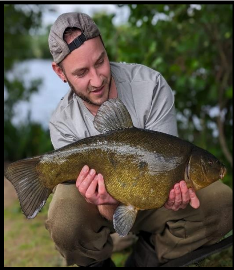
Bov1 Showing us that it too can produce perfectly shaped specimen Tench just like Bov2!