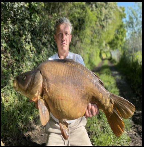
Snake pit producing the goods. Recent improvements will not only enhance this water but improve future prospects of what is an iconic Carp & Tench water.