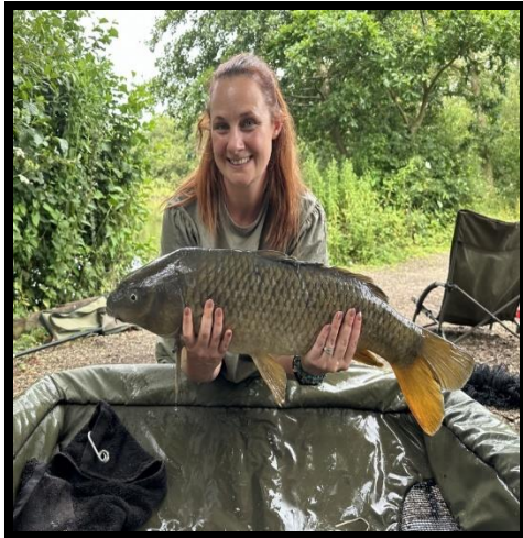
Olivers just keeps getting better! Numbers of fish and specimen weights just keep improving, take a look at the match results.