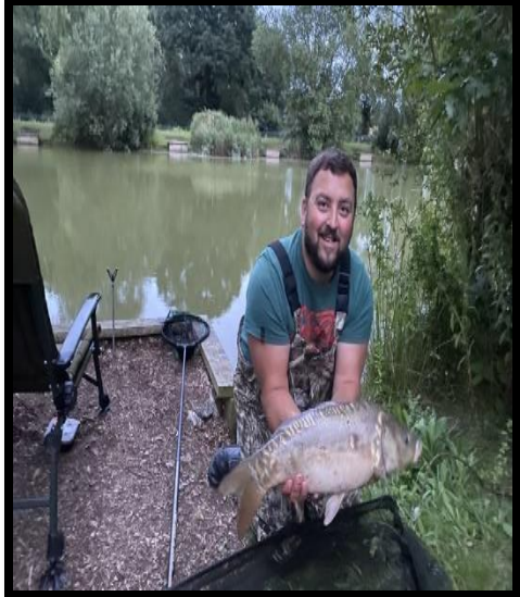
BrookHall has always produced extremely good weights but is now looking better than ever.