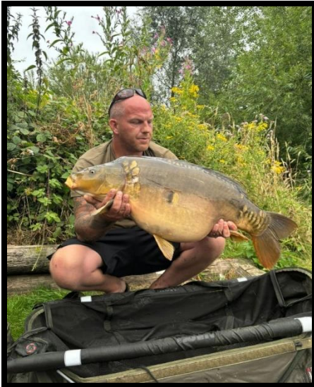
Another Thirty from Brakes Long Lake. Recent Pipe works have returned the level back to normal now, just in time for another cracking season.