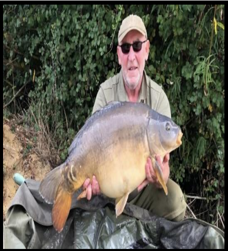
Lodge farm has proved popular this year and why not with such a head of thirties present, not to mention plenty of back up fish providing plenty of action.